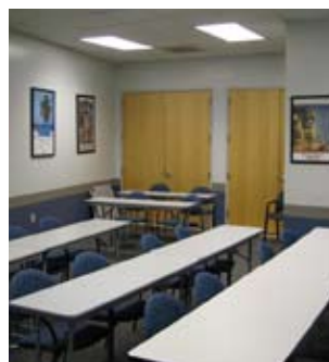
Kaplan Aspect classroom

Kaplan Aspect, Washington DC provides a lively calendar of activities to fill your days. With workshops, parties, walking tours, museum trips, sporting events, and more, you'll discover the best of Washington DC. These activities are lead by a member of the Kaplan Aspect staff and will help you to meet new people and discover the city.