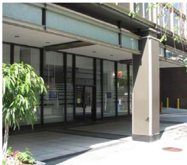
Kaplan Aspect Washington, DC

The Washington, DC Kaplan Aspect school offers first-class modern facilities with an extensive library of self-study material to be used in school. The self-study material includes access to the school's video lab with over 25 TVs and VCRs and DVD players, to the computer lab with over 25 computers with free Internet and WiFi access for international students. Additionally, the DC school has an English Language lab with computers for students to practise the TOEFL iBT.