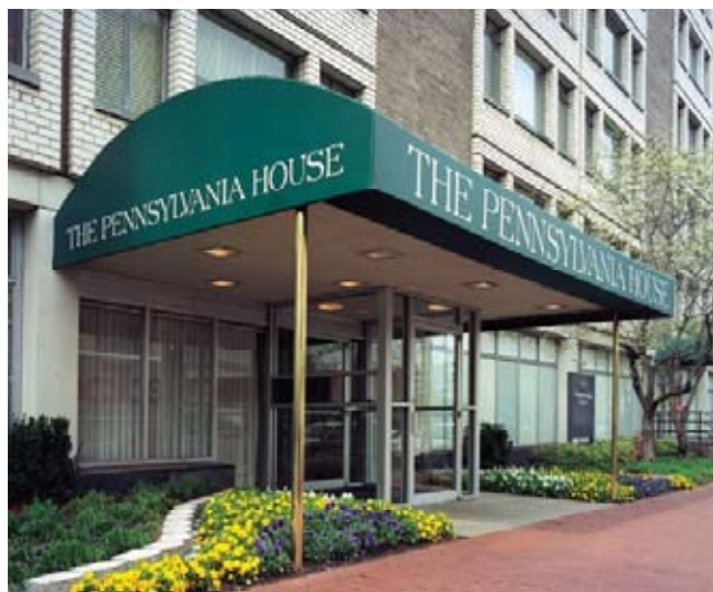
Pennsylvania House main entrance

2424 Pennsylvania Avenue, NW Washington, DC 20037 USA