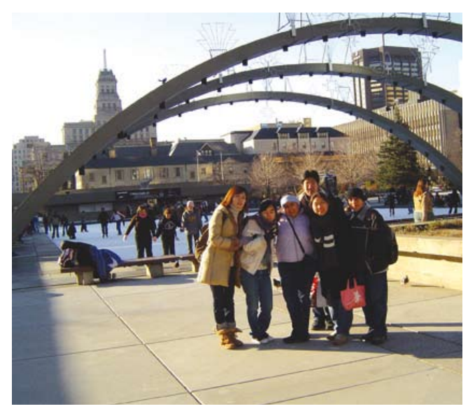
Students in Toronto

Taxi services costs approximately $40 - 60 (+ 10-15% gratuity) to get to your home stay or downtown. The drive averages about 45 minutes.