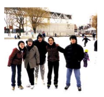
Students during the free time activities