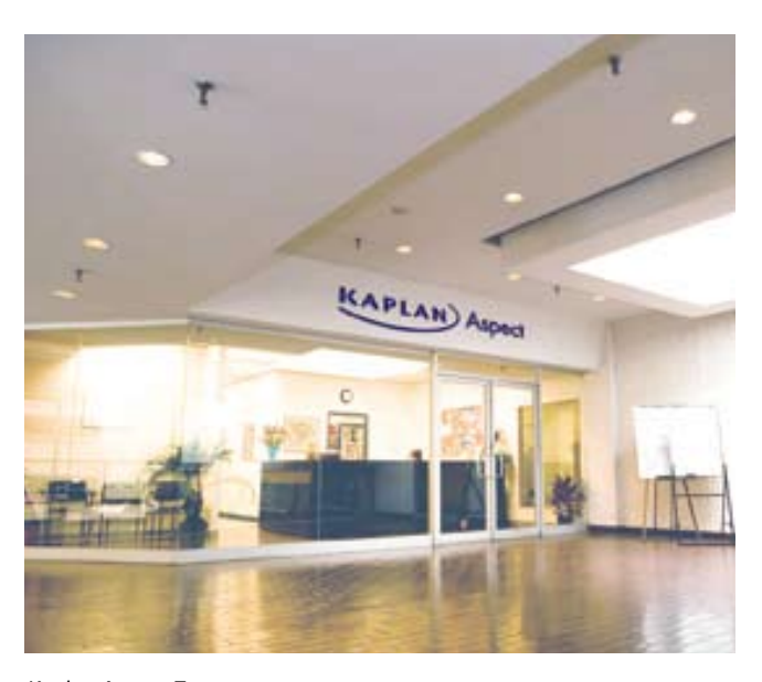
Kaplan Aspect Toronto

Kaplan Aspect Schools in Canada are accredited members of the Canadian Association of Private Language Schools (CAPLS)