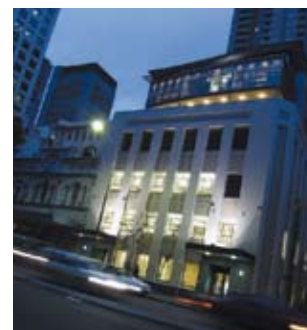
Kaplan Aspect school