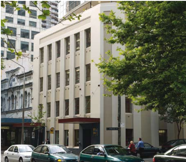
Kaplan Aspect Sydney

For the perfect mix of stunning surroundings, offering beach life, a thriving cultural scene and the excitement of a vibrant metropolis - Sydney is the city to be in. At the end of a day of classes, sit back and drink a cappuccino at a harbour front café and when the weekend arrives, head for Bondi where 'Sydneysiders' soak up the sun and enjoy world-class surfing.