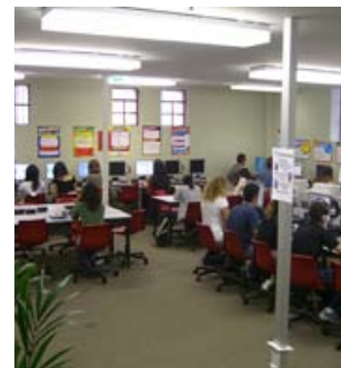
Study centre / library