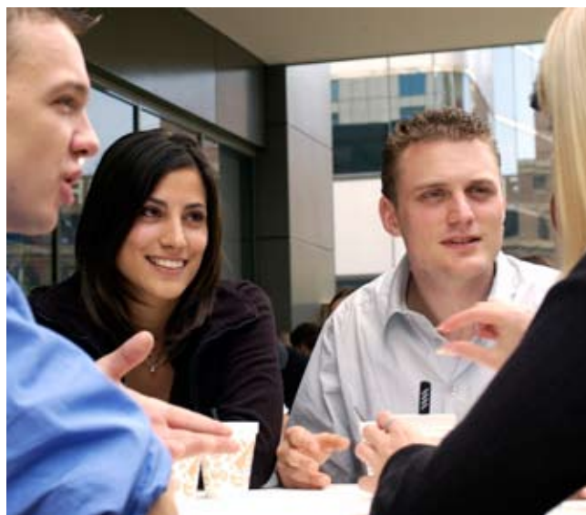
The student café balcony

$11 one way will take the student from Domestic or International Airport to Circular Quay, Town Hall or Central Station, where student can catch a connecting bus, train or ferry. Journey time is approximately 20 minutes.