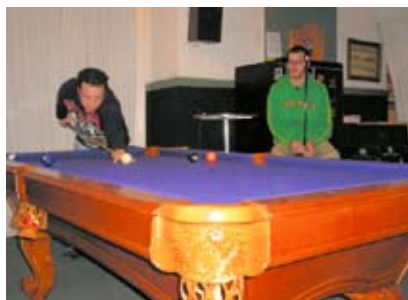
Billiards in the games room