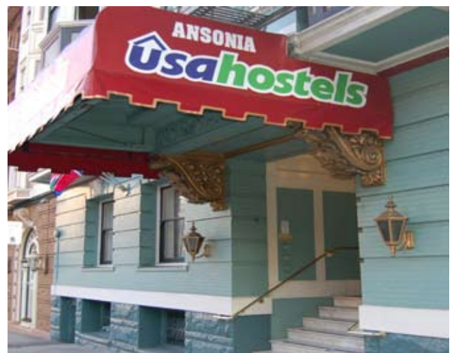
Front Entrance of the Ansonia Residence

711 Post Street San Francisco CA 94109 USA