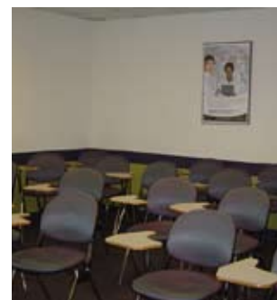
Kaplan Aspect classroom