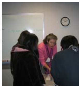
Kaplan Aspect Teacher with students