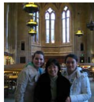
Kaplan Aspect students in Seattle UW library