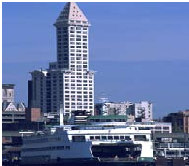
Ferry and Smith Tower

To get to Seattle Kaplan Aspect from the airport, take bus number 194 to downtown (4th ave/ Jackson) and transfer to route 71 towards the University District. The bus route will take you directly to the Kaplan Aspect School at 4216 University Way NE.