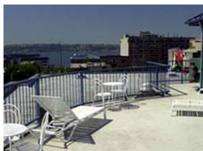
Belltown Inn public deck