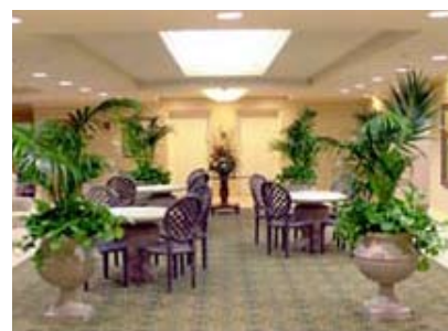
Mediterranean Inn lobby