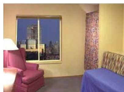
Vermont Inn room