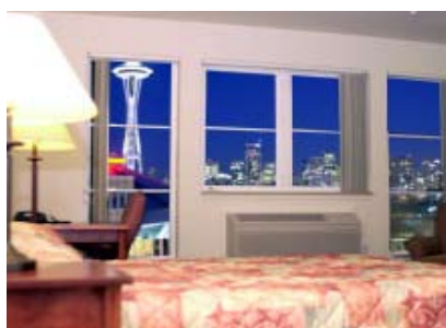
Mediterranean Inn bedroom