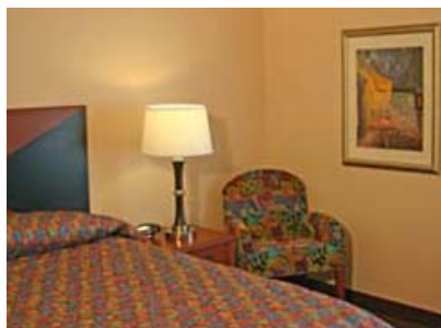
Belltown Inn bedroom