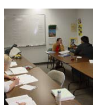
Kaplan Aspect classroom