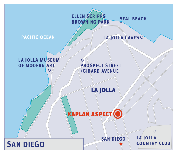
Kaplan Aspect San Diego 1111 Torrey Pines Road La Jolla CA 92037 USA