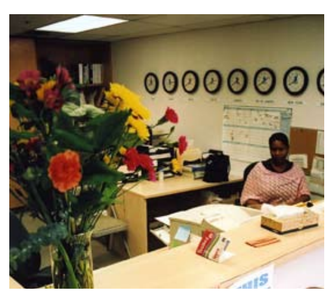
Front desk at Kaplan Aspect San Diego

Express shuttle – approximately $36 (+15% gratuity) Taxi – approximately $65 (+ 15% gratuity)