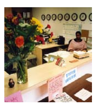
Front desk at Kaplan Aspect San Diego