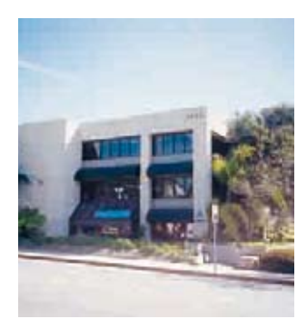
Kaplan Aspect San Diego