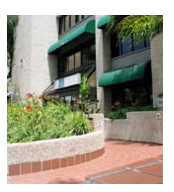
San Diego School