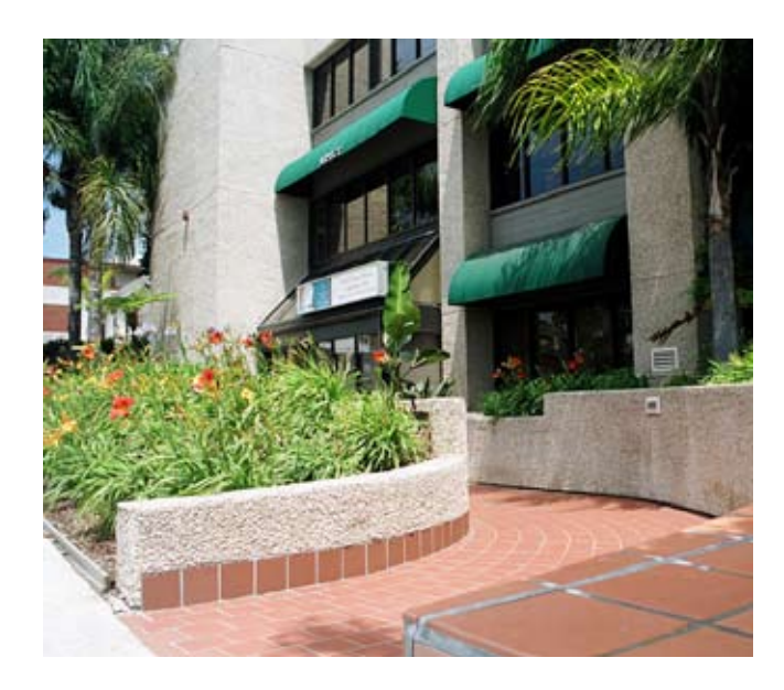
Kaplan Aspect San Diego