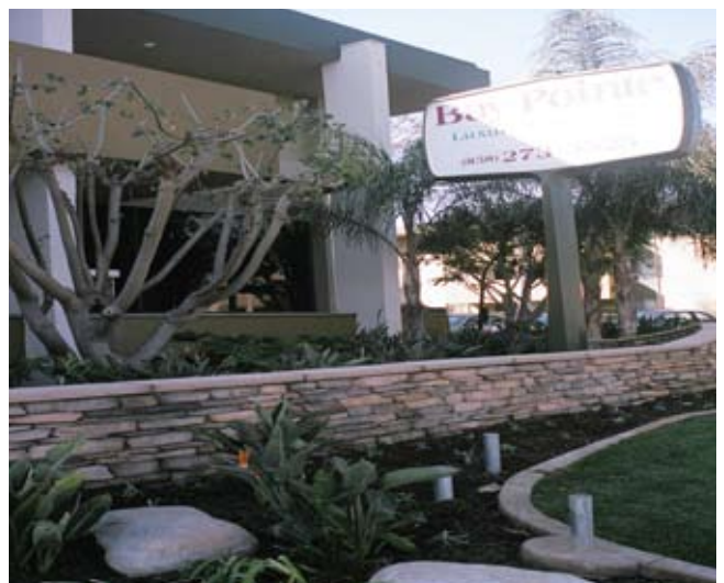
Exterior of Bay Pointe

Bay Pointe Apartments 3366 Ingraham Street San Diego, CA 92109 USA