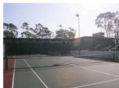
Complex Tennis court