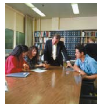
Kaplan Aspect multimedia room