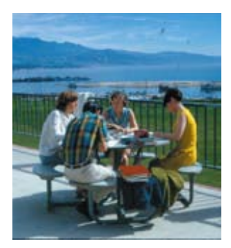
View from SBCC balcony