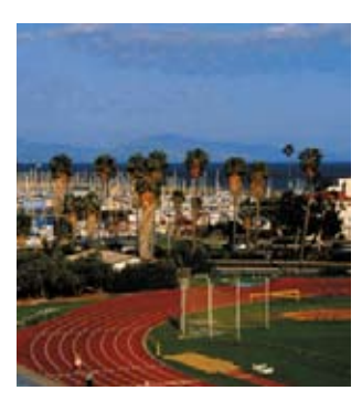
Santa Barbara City College running track