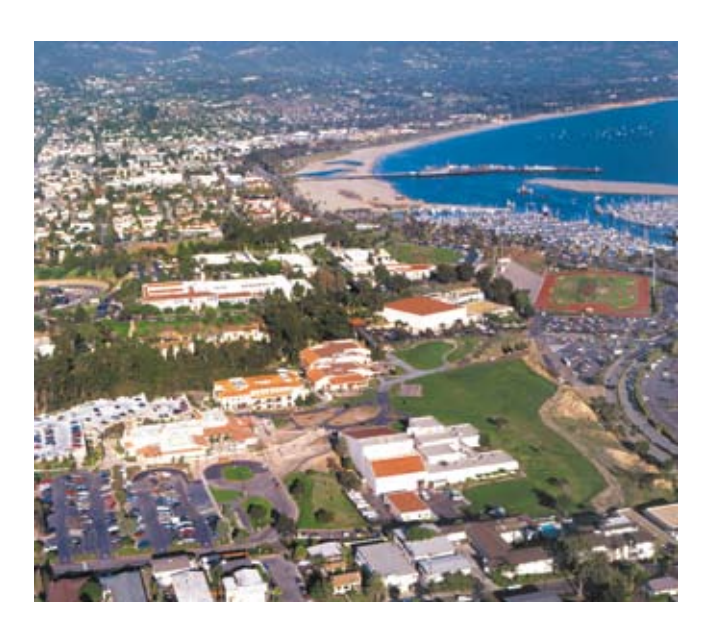
Kaplan Aspect at Santa Barbara City College

Kaplan Aspect is a member of AAIEP (American Association of Intensive English Programmes), TESOL (Teachers of English to Speakers of Other Languages) and NAFSA (Association for International Educators).