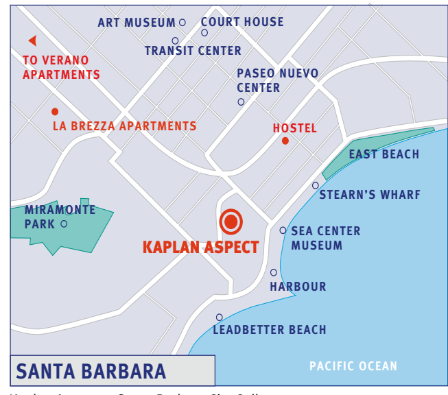
Kaplan Aspect at Santa Barbara City College 721 Cliff Drive Santa Barbara CA 93109 USA