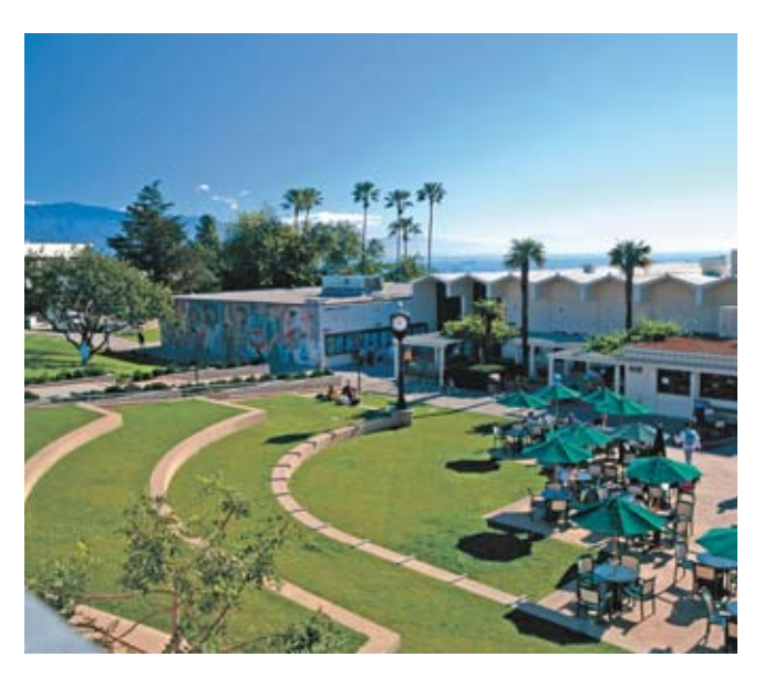
Santa Barbara City College campus

If arriving at Santa Barbara Airport, you can take a taxi to your homestay, for $20-$40. If arriving at Los Angeles International Airport, you can book the Santa Barbara Airbus (www.sbairbus.com) for $42 one-way, and then take a taxi from the bus stop to your homestay (approximately $20-$40).