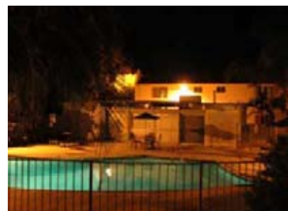
Verano Courtyard swimming pool