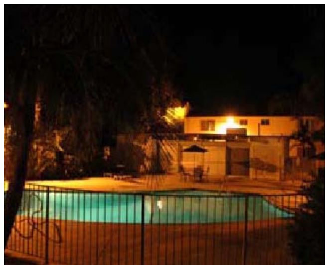
Swimming pool at The Verano Courtyard

Verano Courtyard 249 Verano Drive Santa Barbara, CA 93101 USA