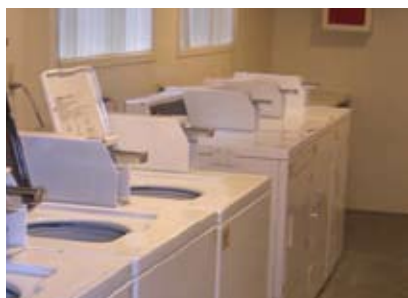
Complex laundry facilities