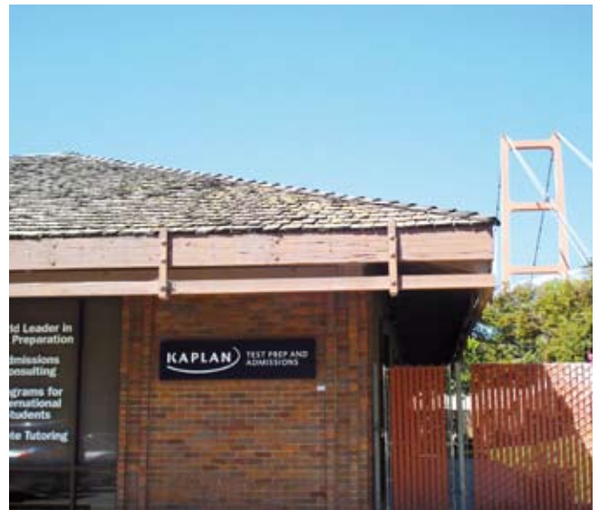
Kaplan Aspect Sacramento

Sacramento is a safe and friendly city with lots to offer for a great student experience! Our school offers first-class modern facilities with an extensive library of self-study material to be used in centre. The self-study material includes access to the school's video lab/computer lab with over 15 TVs and VCRs, and 15 computers. There are 4 student Internet computers available for research and e-mail.