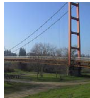
Footbridge to CSUS