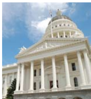
California state capitol building

There are Catholic and Lutheran churches nearby, and a mosque about 15 minutes from the school.