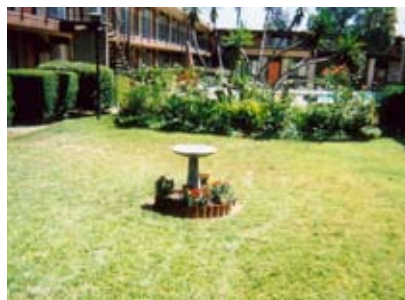
Outside the apartments