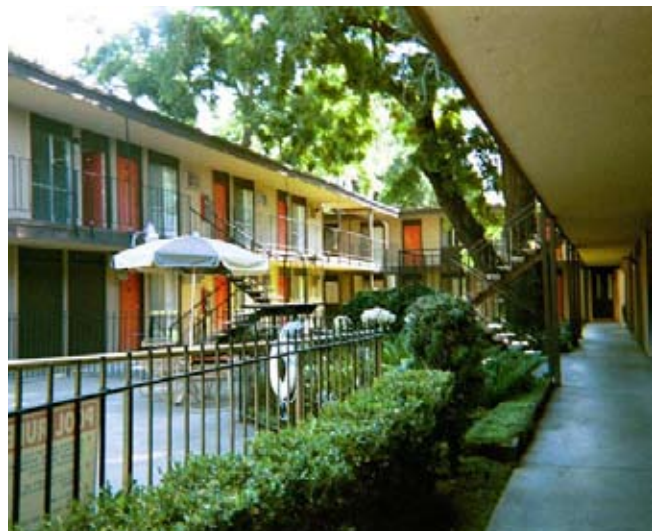
Outside the apartments

Warren Oaks 2430 Fair Oaks Blvd. Sacramento, CA 95825 USA