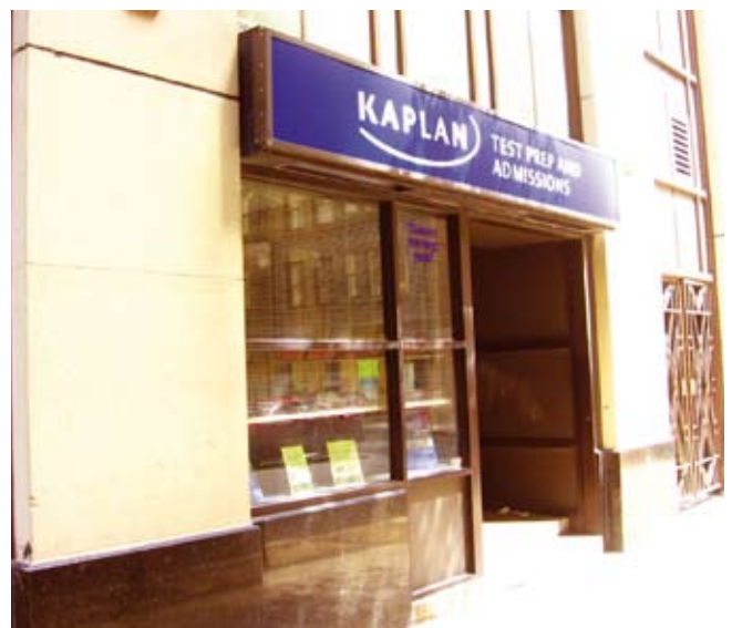
Kaplan Aspect school

Philadelphia is a diverse city, rich in American heritage and the Arts. Independence Hall and the Liberty Bell are just a few examples of the wonders Philadelphia has to offer students. Boutiques, museums, restaurants, and the diverse culture create a feeling that Philadelphia is home to anyone who visits. Philadelphia is the home of over ten highly competitive universities including the University of Pennsylvania.