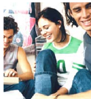
Enjoy a truly international learning environment