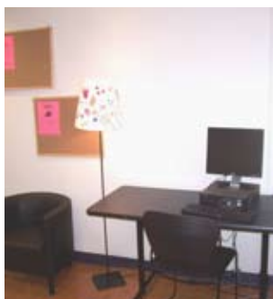
Computer with free Internet in the lounge