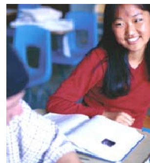
Study English in Philadelphia