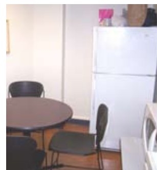
The Kaplan Aspect lounge is a perfect place to enjoy your lunch