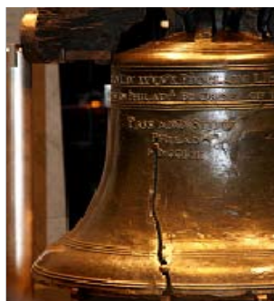
The famous Liberty Bell