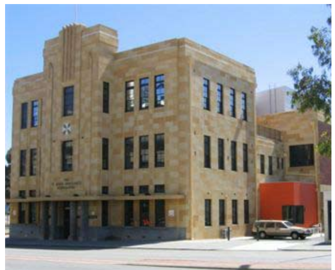
Perth City YHA

Perth City YH 300 Wellington Street Perth 6000 Australia