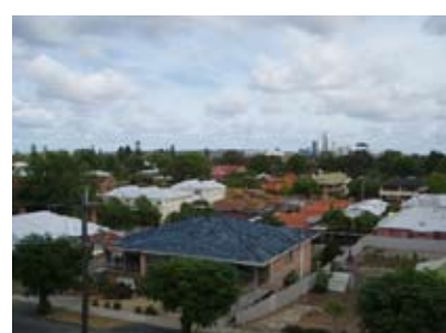
Balcony view from Victoria Park apartment