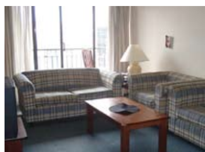
Lounge in a Quest West End apartment