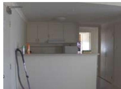
Kitchen in a Quest West End apartment