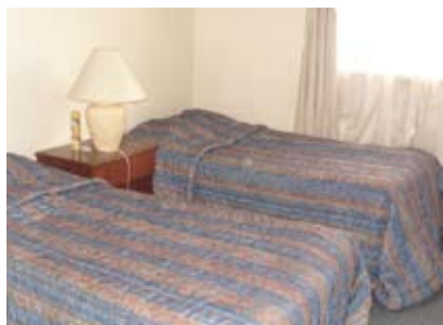
Twin room in Quest West End