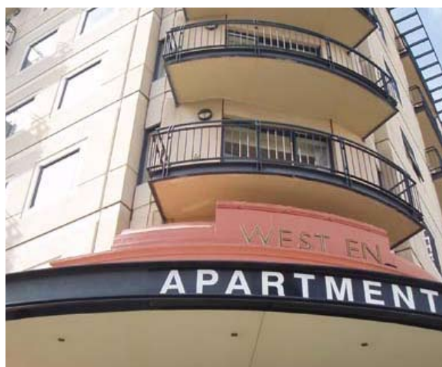
Quest West End Apartment Corner of Milligan and Murray St Perth, Western Australia 6000

The two bedroom apartment accommodates a maximum of three residents available for both single and twin share, with one room containing a queen sized bed and the other equipped with two single beds. Located in Perth's business district, the apartment is an easy walk from restaurants, nightclubs, boutique bars, cafés, city shopping, the Swan River and the magnificent Kings Park Gardens.