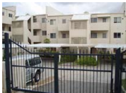
Rear view of Victoria Park apartments