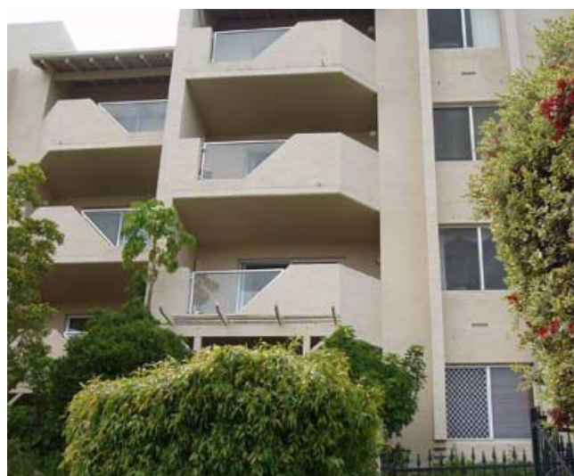
Victoria Park Apartment, Unit 20 12 McMaster Street Victoria Park Perth, Western Australia

It is a beautifully positioned complex in the East Perth suburb of Victoria Park and is able to accommodate both single and twin bookings. The apartment is very close to shops and cafes and bus stops, walking distance to the river and South Perth foreshore with views of the city to Kings Park!