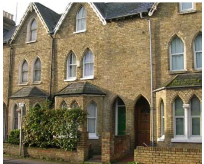
One of the St. Clements

St. Clements Apartments 2 Glebe Street Oxford OX4 1DQ United Kingdom