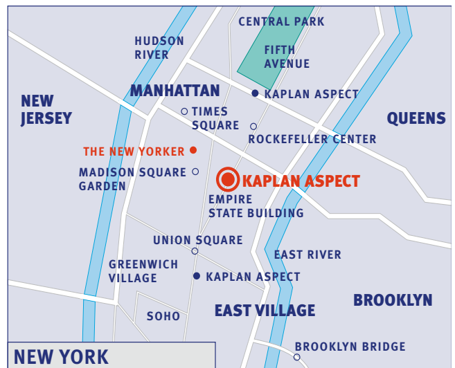
The New Yorker 481 Eighth Avenue (at 34th St.) New York NY 10001

The New Yorker offers students well located accommodation with excellent amenities including 24-hour security, air conditioning and free local phone calls!