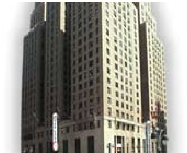
The New Yorker