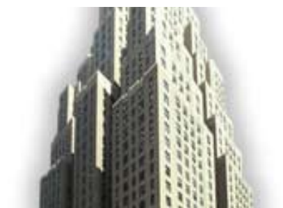
New Yorker Residence