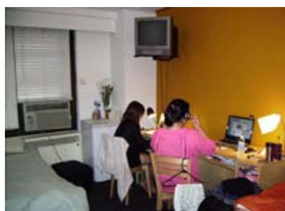
Fully furnished room