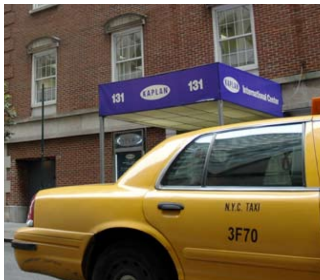
Kaplan Aspect New York Midtown

A shuttle and Bus service is also available at each airport and specific information about these services is available at the Ground Transportation waiting area.