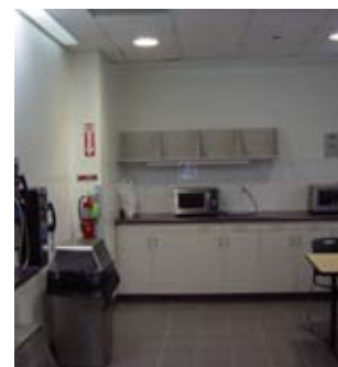
Midtown student lounge