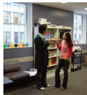
Midtown reception area