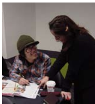
Teacher and student at Kaplan Aspect Midtown