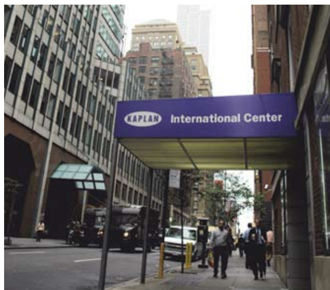
Kaplan Aspect Midtown School

Our Manhattan international school is a beautiful, 6-storey building located in the heart of Midtown Manhattan - just steps away from everything that makes New York, New York. Carnegie Hall, the Theatre District (Broadway), Rockefeller Center and Central Park are all within a 10 minute walk from our front door! Even better, we're less than a 5-minute walk from four of the five major subway lines that can take you to your accommodation, and every place in the city you'll want to visit.