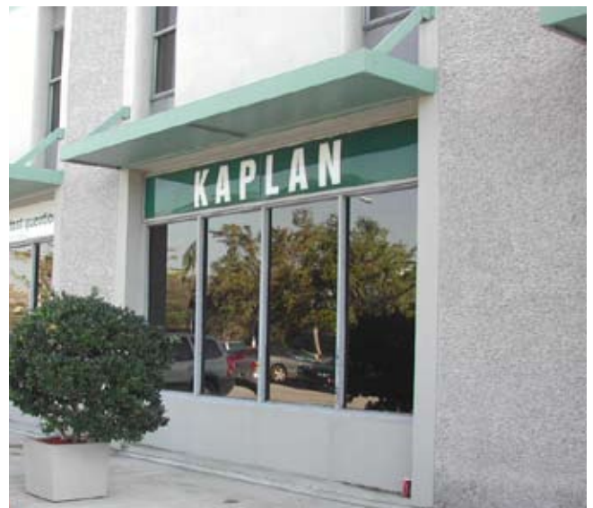
Kaplan Aspect Miami

Kaplan Aspect is a member of AAIEP (American Association of Intensive English Programs), TESOL (Teachers of English to Speakers of Other Languages) and NAFSA (Association for International Educators).