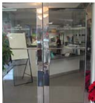
Entrance to the building

There is a huge range of leisure activities available in and around Coral Gables. Every Tuesday and Friday there are school social activities organised by Kaplan Aspect staff.