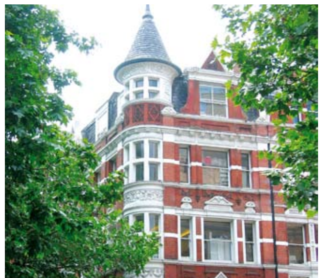
Kaplan Aspect school reception

London is one of the world's remarkable and exciting cities. Marvel at Its fantastic diversity of population and lifestyles reflected through its wide-ranging cuisine, eclectic shops, thriving music scene and wonderful West End theatres. Take a flight and admire the spectacular view of the city on the London Eye. Explore the sights such as Big Ben, Buckingham Palace and the Tower of London. There is always something to do in London!