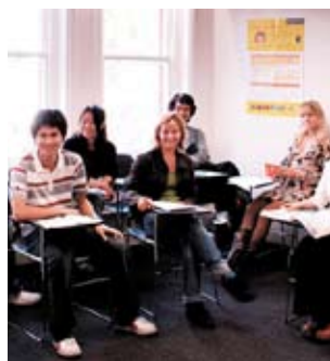
Kaplan Aspect students in a classroom

Kaplan Aspect arranges a full schedule of excursions and activities including excursions to the famous museums, clubbing evenings in Soho and West End theatre trips.