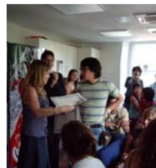
Students in Kaplan Aspect school