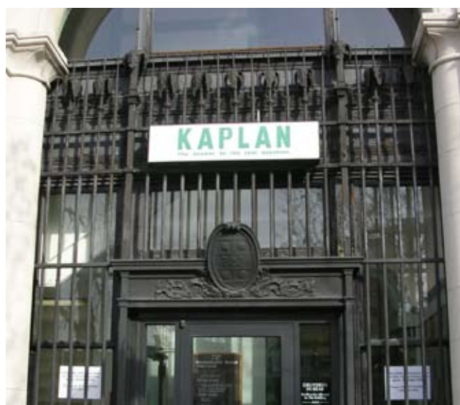
Kaplan Aspect Harvard Square

Kaplan Aspect is a member of AAIEP (American Association of Intensive English Programs), TESOL (Teachers of English to Speakers of Other Languages) and NAESA (Association for International Educators).