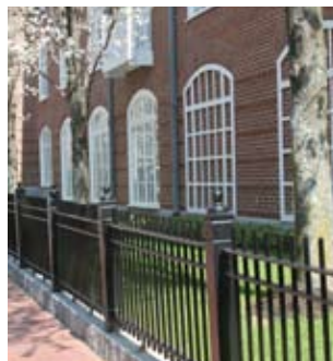
A Harvard College