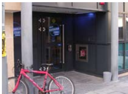
Entrance to the residence