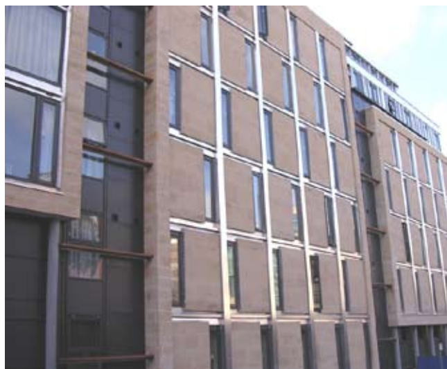
Portsburgh Court Residence

Portsburgh Court 56 Lady Lawson Street Edinburgh EH3 9DH United Kingdom