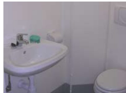
En suite bathroom with a shower