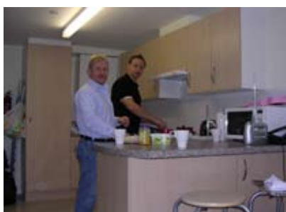
Students making dinner