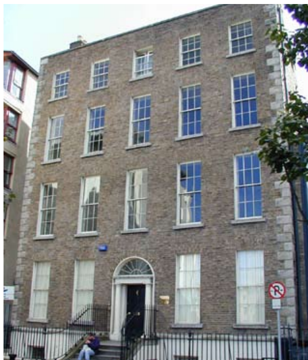
Kaplan Aspect school

The Kaplan Aspect School is housed in a magnificent Georgian building overlooking the River Liffey. The excellent facilities include a large student common room with new flat-screen computers for personal use, a self-study room, a dedicated study room and free wireless Internet access.