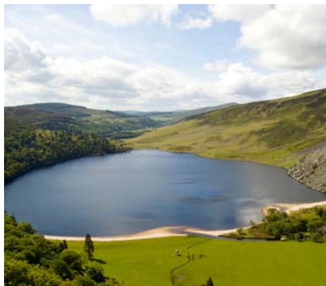
Beautiful Irish countryside