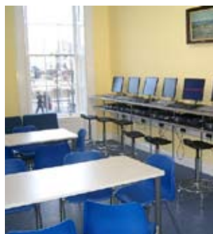
Kaplan Aspect student common room

A full and varied social programme is organised each week. Please see overleaf for an example timetable.