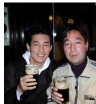
Students enjoying an Irish beer at one of the pubs in Temple Bar