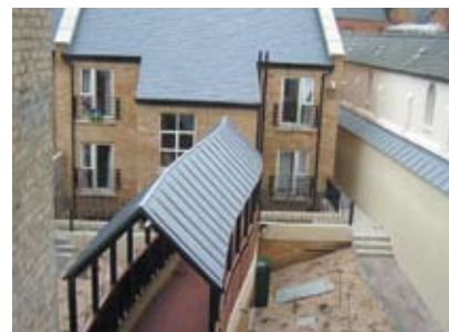
Attractive garden area