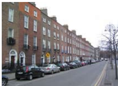
Baggot Street Lower