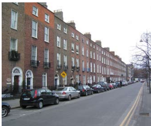
Baggot Street Lower