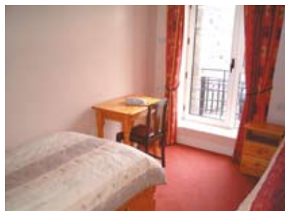
Twin bedroom with study facilities