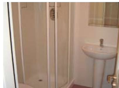
Modern and clean en suite bathroom