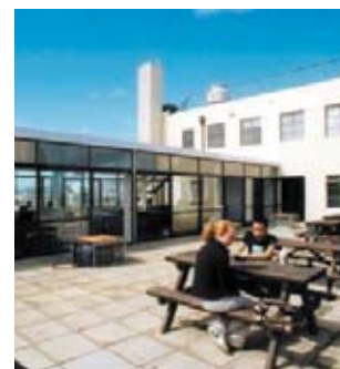
The roof-top café