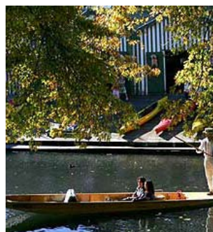
Punting on the Avon River