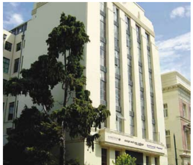
Kaplan Aspect Christchurch

Kaplan Aspect Christchurch is ideally situated in the city centre next to Cathedral Square and within a moment's walk from cafes, bars, shops, libraries and central bus routes.