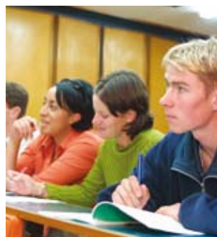
Students in the classroom