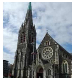
Christchurch Cathedral Square