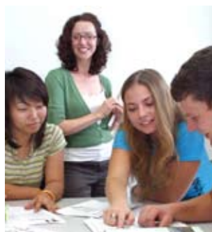
Kaplan Aspect teacher and students

Students can join the Centennial Leisure Centre, located close to the school, for indoor sports and fitness training. The centre has excellent facilities including a fitness centre, swimming pools, a sauna, spa, and steam room.