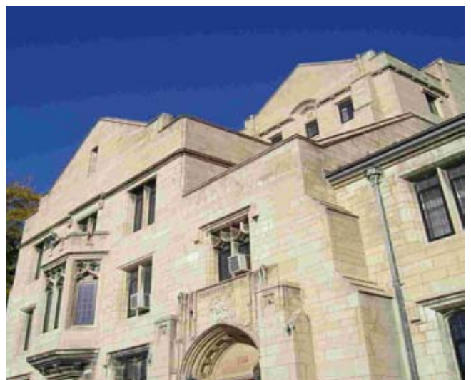
International House of Chicago

International House of Chicago 1414 East 59th Street, Chicago, IL 60637 USA