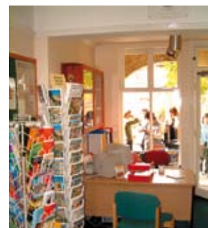
Interior of the school