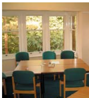
Kaplan Aspect Classroom

A full and varied social programme is organised each week. Please see overleaf for an example timetable.