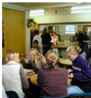
The school cafeteria shop