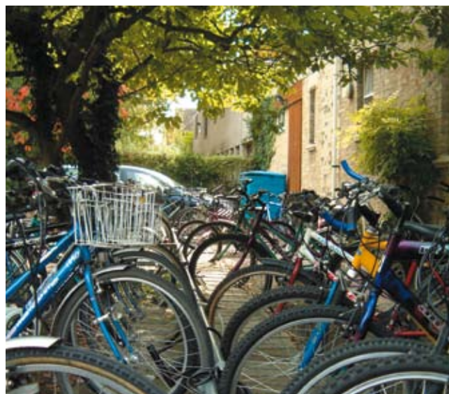
Many bikes in Cambridge

Approximately every 30 minutes. Journey time: 30 minutes