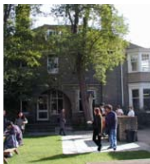
The school garden area