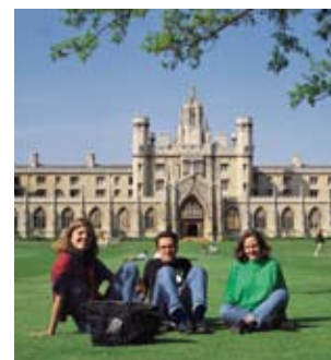
Kaplan Aspect students