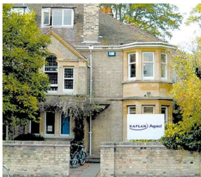
Kaplan Aspect Cambridge

Founded in the late 1970's, Kaplan Aspect Cambridge is housed in a large, converted Edwardian house with a modern extension. The school is west of the city centre in the quiet, residential area of Newnham, a 10-minute bus ride away from the centre. The school has its own gardens where we hold barbecues on warm summer evenings.