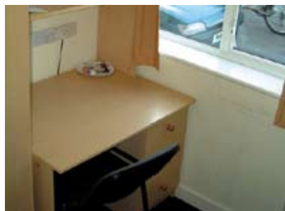
Each bedroom includes a desk and chair for studying