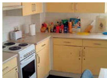
Fully equipped shared kitchen