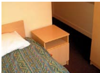
Single study bedroom