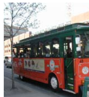
Bus in Boston