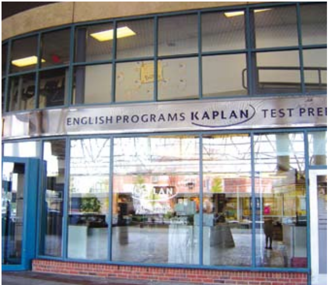
Kaplan Aspect Boston

The school offers modern, first-class facilities with access to the video lab with over 25 TVs and VCRs, to the two computer labs with over 20 computers and to a third computer lab with free internet access for international students. Students will also have an extensive library of structured study materials to be used in center, which includes practice iBT TOEFL exams, ESL practice tapes, and ELLIS, the premier pronunciation software package for English language learners.