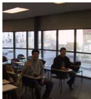
Kaplan Aspect students in the classroom

Because of Boston's rich cultural history, there are many specific events in Boston for our students to enjoy. In the summertime there are free classical music concerts outside at the Hatchshell and free Shakespearean plays on Boston Common, and no one can visit Boston and not see the Red Sox play at Fenway park. The Kaplan Aspect school also organises a varied social programme with activities such as movie nights, meals at American restaurants, reduced pricing or free tickets to museums, theatres, and shows, an international boat cruise, baseball, basketball and soccer games, book club, potluck dinner, conversation group and pizza parties.