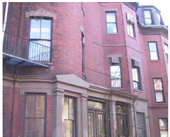
International Guest House

International Guest House 237 Beacon Street Boston, MA 02116 USA