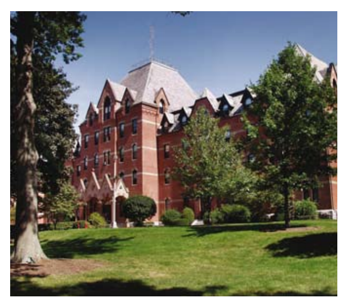
Dean College, Boston

Kaplan Aspect is a member of AAIEP (American Association of Intensive English Programs), TESOL (Teachers of English to Speakers of Other Languages) and NAFSA (Association for International Educators).