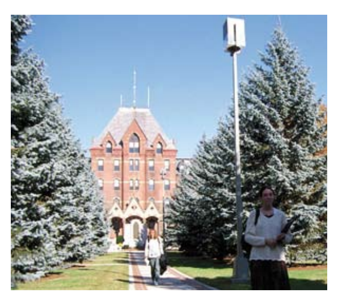
Dean College campus

Students booked in a homestay should go directly to their homestay. Students booked for the dormitory should arrive at Dean College Public Safety to check in. Public Safety is located in the lower level of Dean Hall.