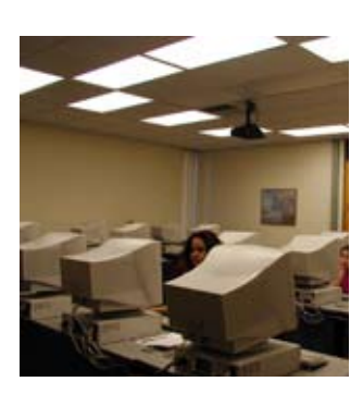
Kaplan Aspect computer lab