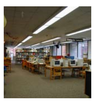
Dean College library