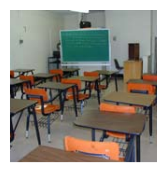
Kaplan Aspect classroom