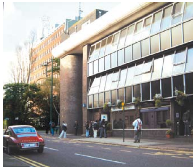
Kaplan Aspect Bournemouth

Kaplan Aspect Bournemouth was built in the 1960's. It is a modern building with three floors and is situated in the area of Westbourne, roughly 5 minutes by bus from Bournemouth town centre. The school is located on a main street and has a lovely patio at the back.