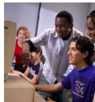
Students in multimedia centre