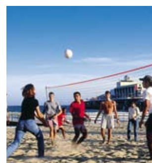
Kaplan Aspect students enjoying a game of volley on the beach