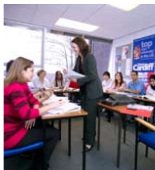
Kaplan Aspect teacher and students in a classroom

A full and varied social programme is organised each week. Please see overleaf for an example timetable.