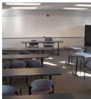
Kaplan Aspect classroom

There is a wide choice of activities available to students in Berkeley. Kaplan Aspect Berkeley also provides 2 organised social activities per week. Popular activities include visits to Fisherman's wharf, the Alcatraz Tour, the Golden Gate Bridge Walking Tour, Napa Valley Wine tasting, a trip to Santa Cruz, Muir woods hiking, Yosemite camping, a visit to the Great America theme park, movies or going to watch an Oakland A's/Giants Baseball Game.